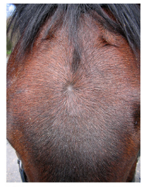
A horse with radial (R) facial hair whorl