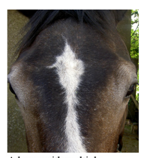
A horse with multiple (vertical) facial hair whorls