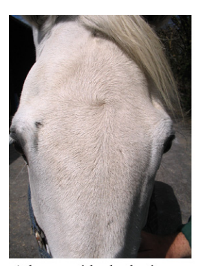
A horse with clockwise (C) facial hair whorl